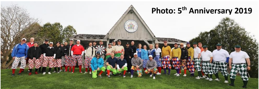
Photo: 5 th Anniversary 2019